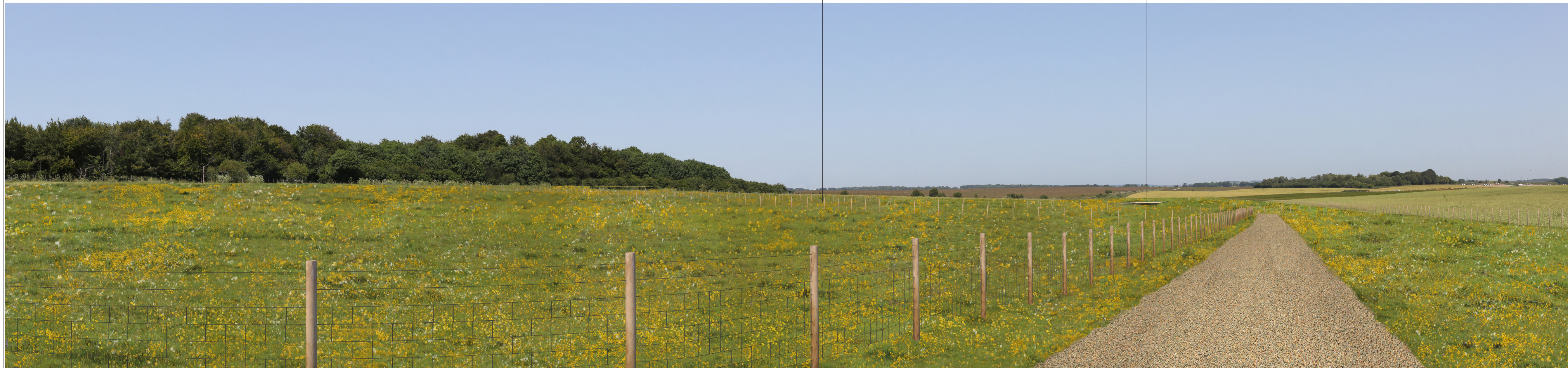
PROPOSED (SUMMER YEAR 15)